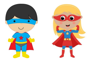
HELP YOUR CHILD BE A <u>HERO</u>!

Parents/Guardians must sign their child/children in and out each day on the classroom iPad. It is very important we have your signature proving your child/children are in attendance each day.